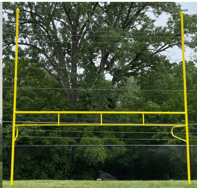
After AA-1000-GP-YO Yellow was Applied