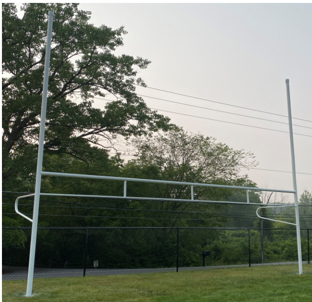
After AA-1000-WP White Primer was Applied

Manufactured By: Allureglow USA Inc. and Allureglow USA Inc. makes no representation as to the suitability of any given products; it is up to the buyer or user to determine if the product is suitable for the given application.